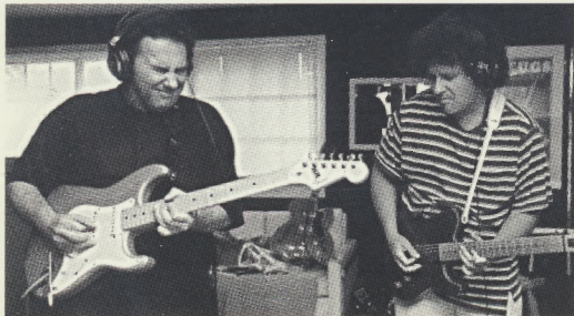
Duke Robillard & AR

For further information on Blue Plate Music releases write to: Blue Plate Music, 33 Music Square W., #102 A, Nashville, TN. 37203 or call 800 521-2112